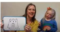
Learn the Makaton signs for king, queen, prince, princess, palace/ castle: