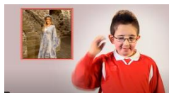
Something Special Out and about: Castle