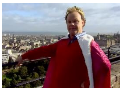
Something Special S8Ep20: Castle